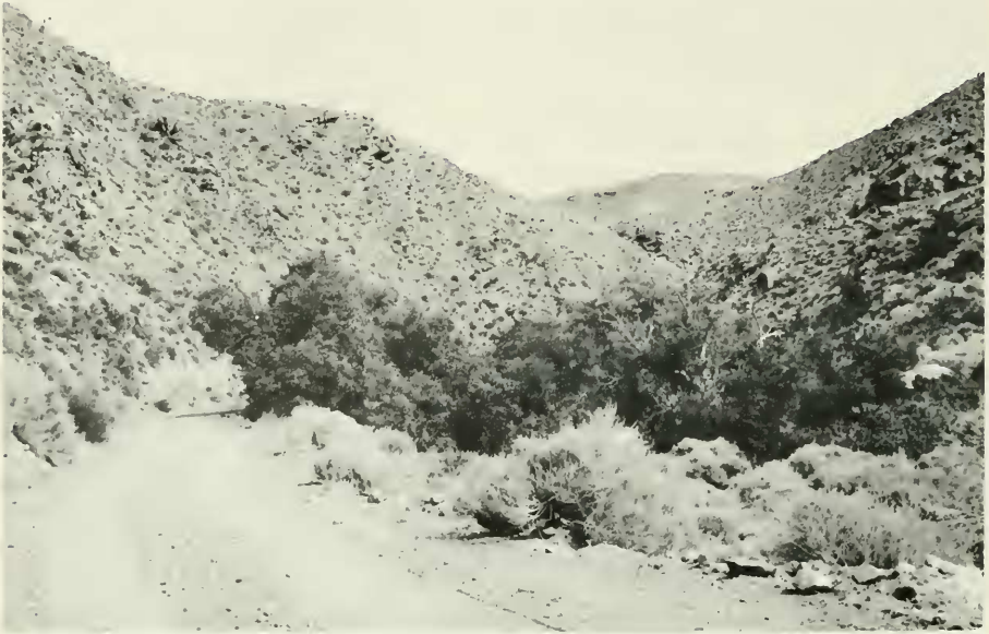
Figure 5. Nelson Mountains, Grapevine Canyon. Elevation 4850 feet. Station 16. The environment viewed from the south as it appeared in May 1959. This station closely resembles that of the type locality for Gerrhonotus panamintinus in Surprise Canyon, Panamint Mountains. Two specimens were obtained here; an adult female on May 2, 1959, and an adult male on June 10, 1960. See plate 1 (CAS 89676).

Keeler, Owens Valley. Out of a total of 30 stations, only one produced a specimen of G. panamintinus .